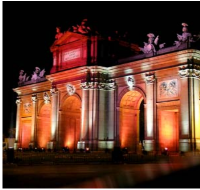
Puerta de Alcalá