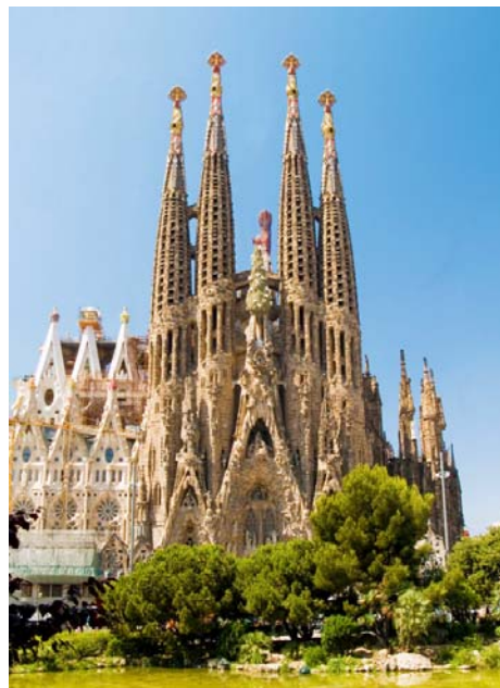
Cathedral of the Sagrada Familia