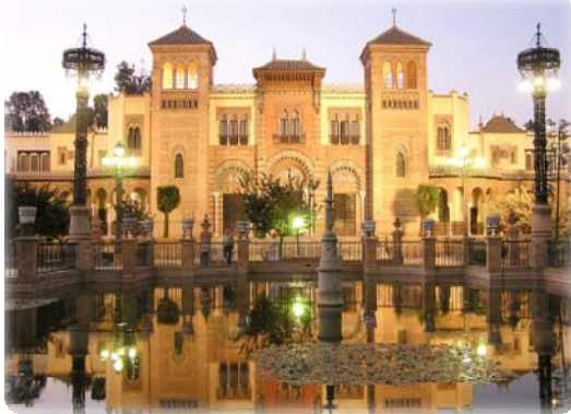
Seville: Plaza de Espana

Buffet breakfast. Departure through the once-remote region of Extremadura, home to many of the “conquistadors”. Arrival in ancient Merida. Free time for lunch. (Lunch is included in PREMIUM PACKAGE.) In the afternoon, visit the impressive Roman amphitheatre archeological site before continuing to Seville. Accommodations.