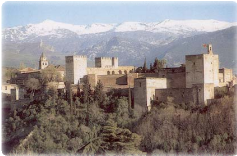
Granada: The Alhambra Palace

Buffet breakfast. Depart to Cordoba. Visit one of the world's marvels, the former Great Mosque (now a cathedral). Free time for lunch on your own. Continue to Granada, passing thousands of acres of olive groves. PREMIUM PACKAGE includes dinner tonight. This evening, an excellent suggestion would be to visit (optional) the quaint and typical Albaicin quarter, where Andalusian customs, music and wine join to create an enchanting atmosphere. (PREMIUM PACKAGE includes this visit).