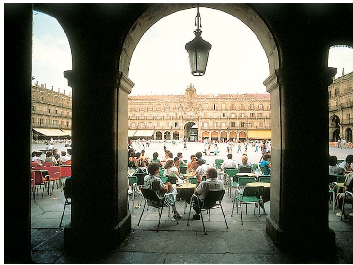
Madrid - Plaza Mayor