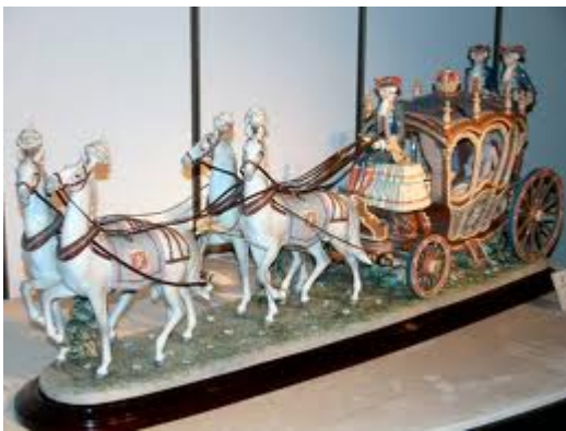
Valencia: Lladro Porcelaine

Buffet breakfast. This morning, enjoy an escorted tour of the magnificent Alhambra and the verdant Gardens of the Generalife. At mid-day departure to the east coast of Spain arriving to Valencia for accommodations.