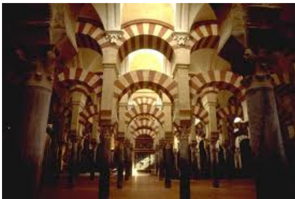
Ancient Mosque in Cordoba