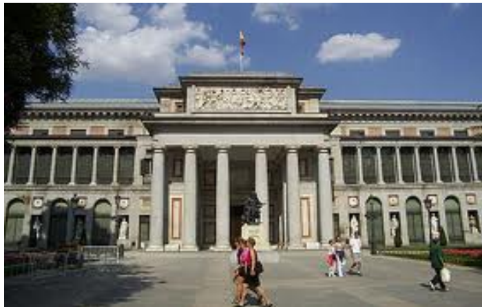
Madrid - The Prado Museum

Buffet breakfast. This morning's escorted sightseeing tour will allow you to get a glimpse of some of Madrid's most outstanding attractions, like the Puerta del Sol, the magnificent fountains of Neptune and Cibeles, the stately Alcala Gate, the busy Gran Via, the Plaza de España and the Plaza de Oriente. Free time for lunch on your own. PREMIUM PACKAGE includes a Lunch today. Highly recommended this afternoon, is an optional tour to the Imperial former capital city of Toledo, where you will be escorted through its narrow cobblestone streets, soaking up the medieval atmosphere. Touring will include the interior of the magnificent Gothic cathedral and a visit to St. Tome Church, where El Greco's masterpiece painting is displayed. There will also be some time for shopping for the unique typical local artisanry. PREMIUM PACKAGE includes the Tour to Toledo. Return to Madrid for accommodations.