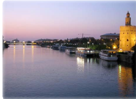
Guadalquivir River & Tore del Oro